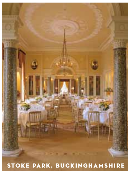
STOKE PARK, BUCKINGHAMSHIRE

03 MARCH: Vintage Wedding Evening , My Sugarland, EC1 London. Appointments from 7pm - 9.30pm. Call 020 7841 7131 or go to mysugarland.co.uk . 07 MARCH: Wedding Open Day , Stoke Park, Buckinghamshire. Open 11am - 4pm. Call 01753 717171 or go to stokepark.com . 21 MARCH: The Stapleford Park Wedding Show . Open 12 noon - 4pm. Call 01572 787016 or go to staplefordpark.com .